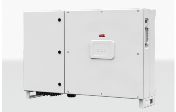
ABB string inverters PVS-60-TL