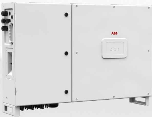
— PVS-60-TL string inverter

This new addition to the PVS string inverter family, with 3 independent MPPT and power ratings of up to 60 kW, has been designed with the objective to maximize the ROI in large systems with all the advantages of a decentralized configuration for both rooftop and ground-mounted installations.